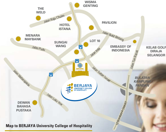
Map to BERJAYA University College of Hospitality