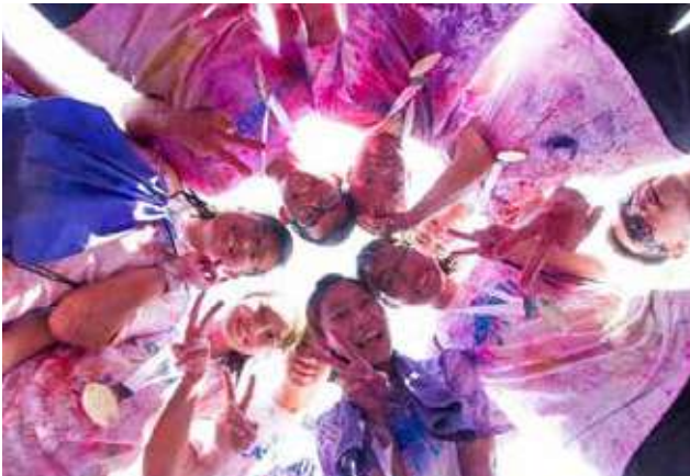
Splash Out Charity Run

The School is very proud of its students' success achieved through active participation in live events and tours. These activities creates many opportunities for them to further enhance their learning.