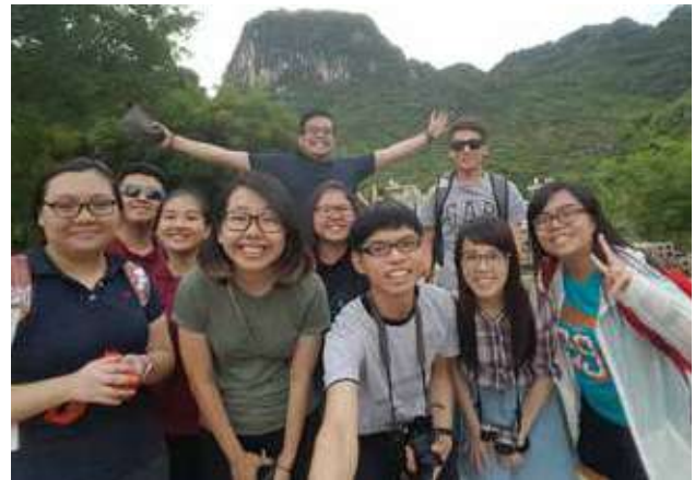
Study Tour to Guilin