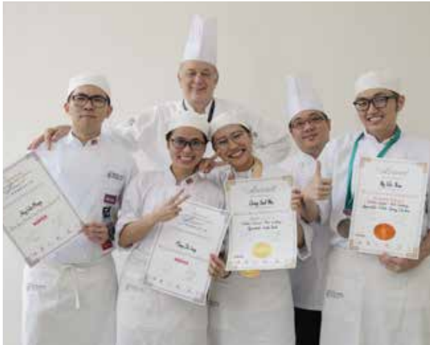
HOFEX - Hong Kong International Culinary Classic 2017