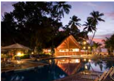
Berjaya Beau Vallon Bay Resort & Casino