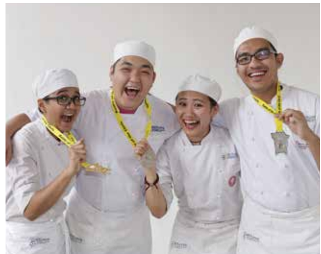
Penang Battle of the Chefs 2016