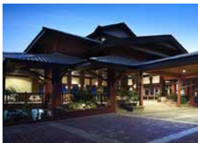
Redang Island Resort