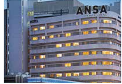
Ansa Kuala Lumpur