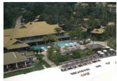
The Taaras Beach & Spa Resort