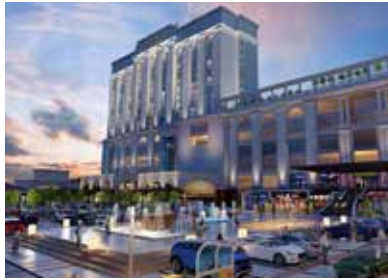
Berjaya Waterfront Hotel, Johor Bahru