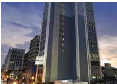
Berjaya Makati Hotel