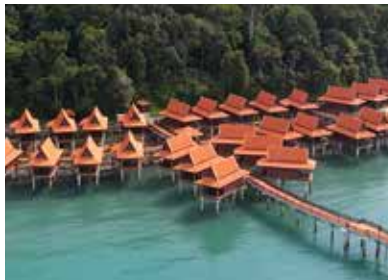
Berjaya Langkawi Resort