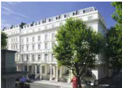
Berjaya Eden Park London Hotel