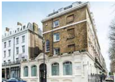
The Castleton Hotel