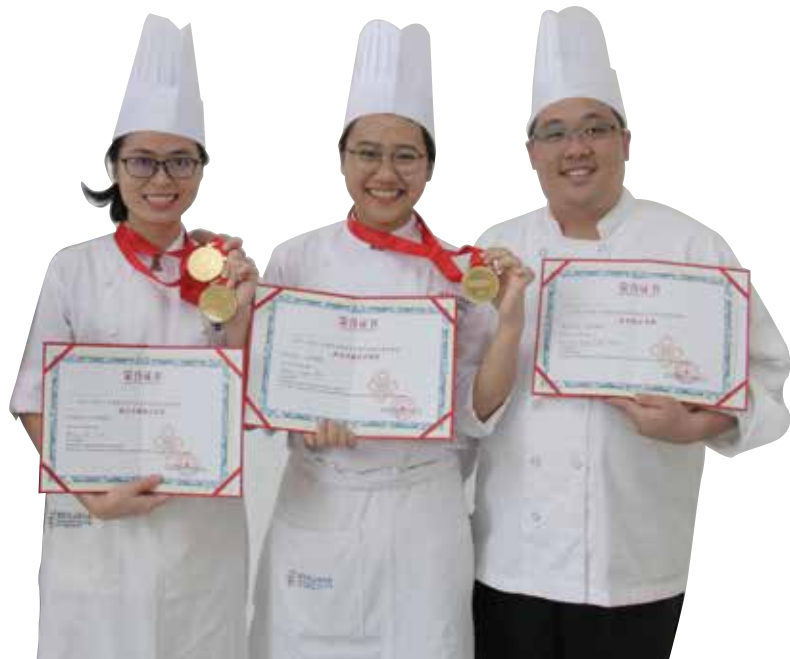
China-ASEAN Vocational Education Students Culinary Skill Competition 2017

Our students are specially trained by a team of professional chefs, thereby excelling in competitions and winning awards, making them much sought-after in the industry.