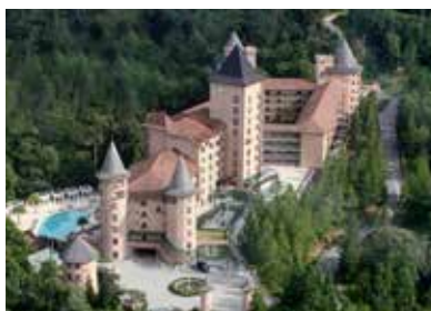
The Chateau Spa & Organic Wellness Resort, Berjaya Hills