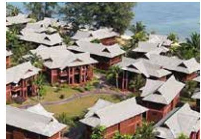
Berjaya Tioman Resort