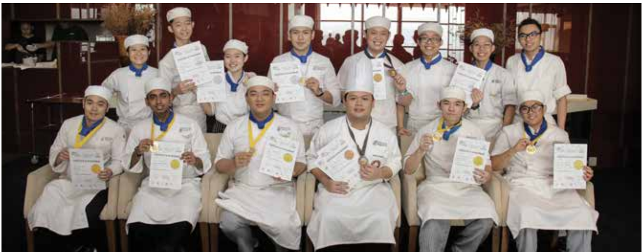
iChef Malaysia Culinary Competition 2017