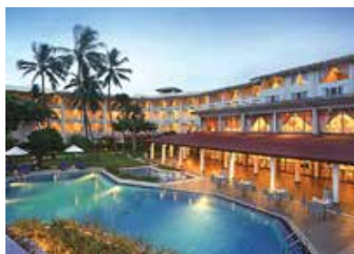
Berjaya Hotel Colombo