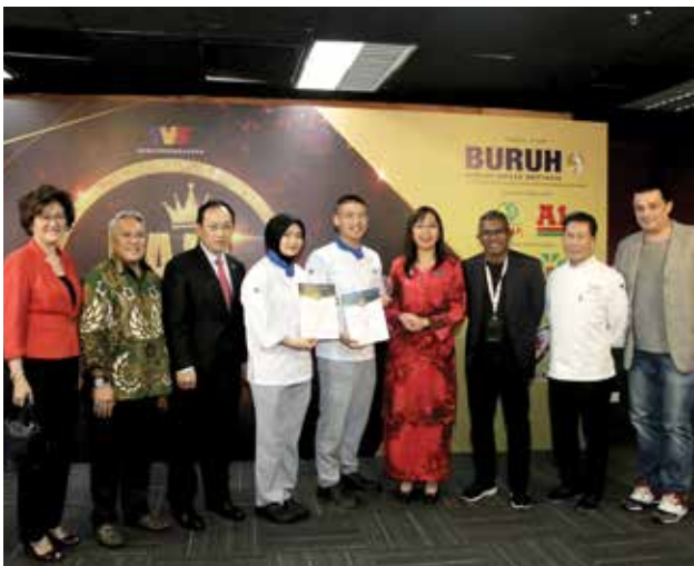
Raja Sawit 2019