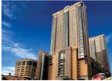
Berjaya Times Square Hotel, Kuala Lumpur