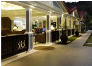
Berjaya Praslin Resort