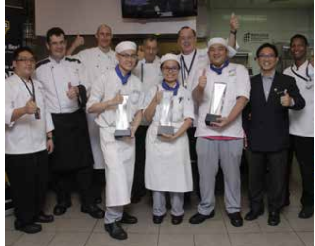
California Competition 2016