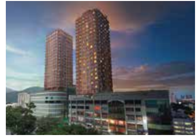
Berjaya Penang Hotel