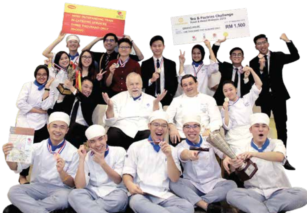
FHM 2019 - Culinaire Malaysia Competition