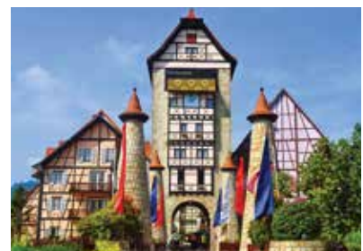
Colmar Tropicale, Berjaya Hills