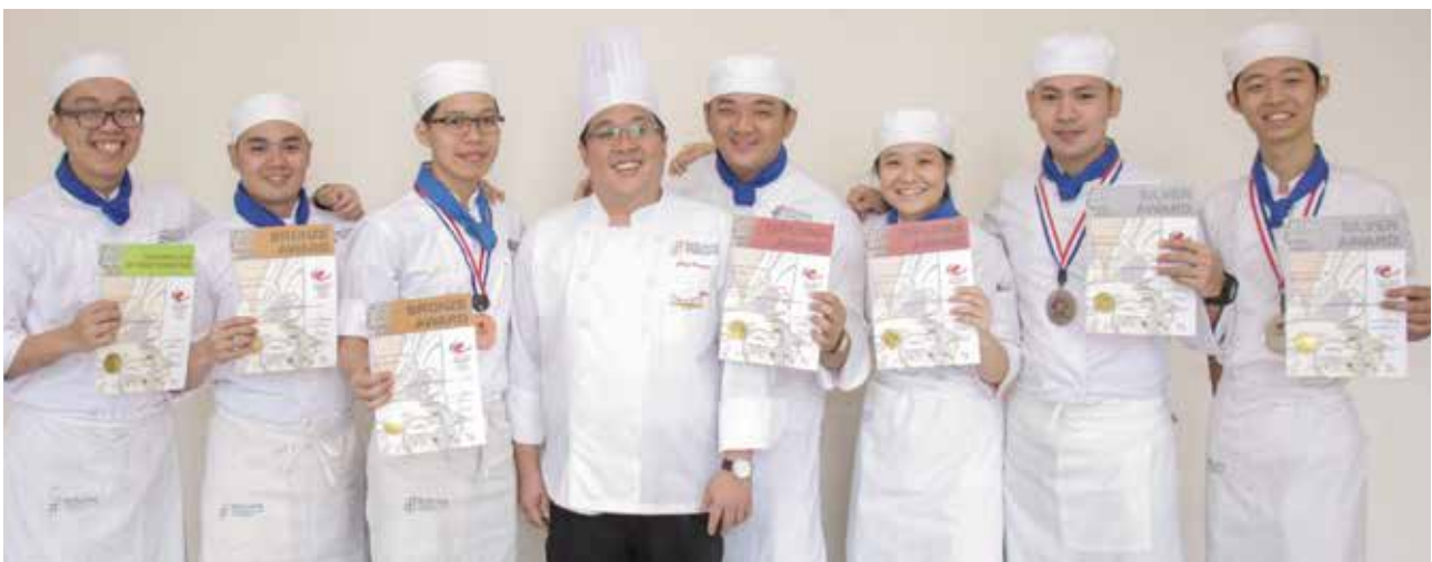
FHM 2017 - Culinaire Malaysia Competition